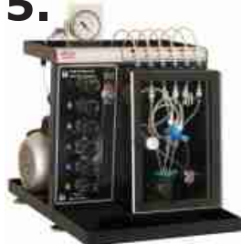
MS VFC Unit (Addon)