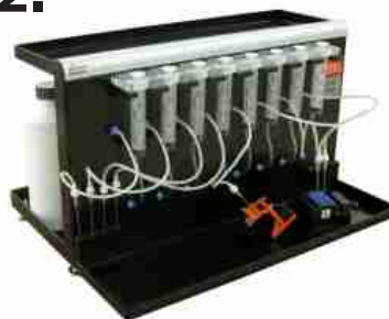
MS EZZY Fill Unit